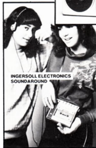
INGERSOLL ELECTRONICS SOUNDAROUND