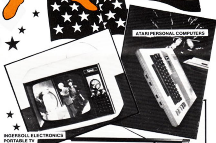
INGERSOLL ELECTRONICS PORTABLE TV

Our first prize, Overall, is a Week for two in America!